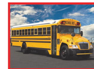
School bus routes may change to avoid unsafe railroad crossings.