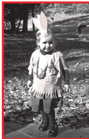
A Thanksgiving program in Marietta hopes to give food baskets to 1,450 families.

If you work or live near the Marietta area, you may wish to help the Center for Family Resources (with the Cobb County Department of Family and Children Services) provide Thanksgiving baskets for those in need. The Thanksgiving Program has been giving the baskets to families for over twenty years, with 1,000 families receiving the gift baskets just last year. Opportunities include helping with packing, sorting, and distributing food at the Cobb Civic Center November 24 through November 26. Shifts are available in two hour increments.