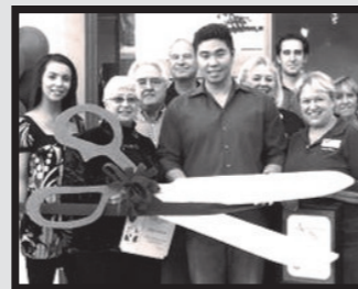
The Douglas County Chamber of Commerce is always a part of ribbon cuttings!

For those looking for general information about the area, the Douglas County Chamber of Commerce website, www.douglascountygeorgia.com , includes a history of the county, demographics and other interesting information, and provides links to