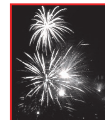
Fireworks conclude the evening on Heroes Day.